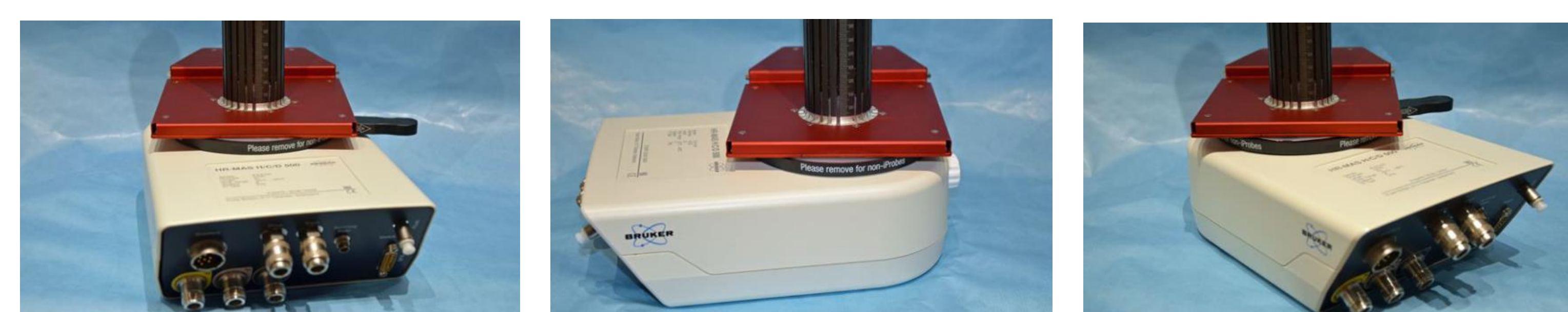
Figure 2: The orientation of the MAS probe to the RT shim system is a parameter of MASshim (left: angle 0, middle: angle 90, right: angle 45).