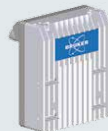
Fully integrated XFlash® detector

Sum spectrum (gray) of maps above and deconvoluted element peaks for silicon (blue) and tungsten (yellow)