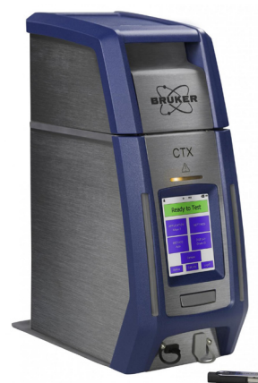
CTX™ Portable XRF analyzer Mg (12) to U (92)