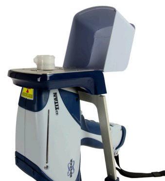
S1 TITAN Handheld XRF analyzer Mg (12) to U (92)