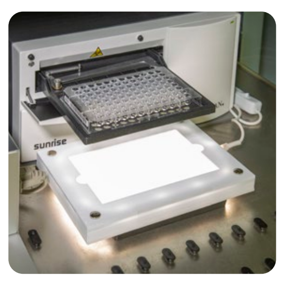
Fig. 3: The SUNRISE Reader allows standardized reading of the MICRONAUT antibiogram and gives proof of adjusted Mc Farland dilution.

Dr. Scarparo's previous systems also contained an extensive list of test antibiotics and relative concentrations, but one of the systems (Sensititre) presented the major problem of bacterial inoculation below the international recommendations of EUCAST or CLSI [7]. The other previous method (Vitek 2) had reduced accuracy and reliability due to the fact that the MIC was 'calculated', and not the true MIC. In addition, users could not previously visualize microbial growth on the cards.