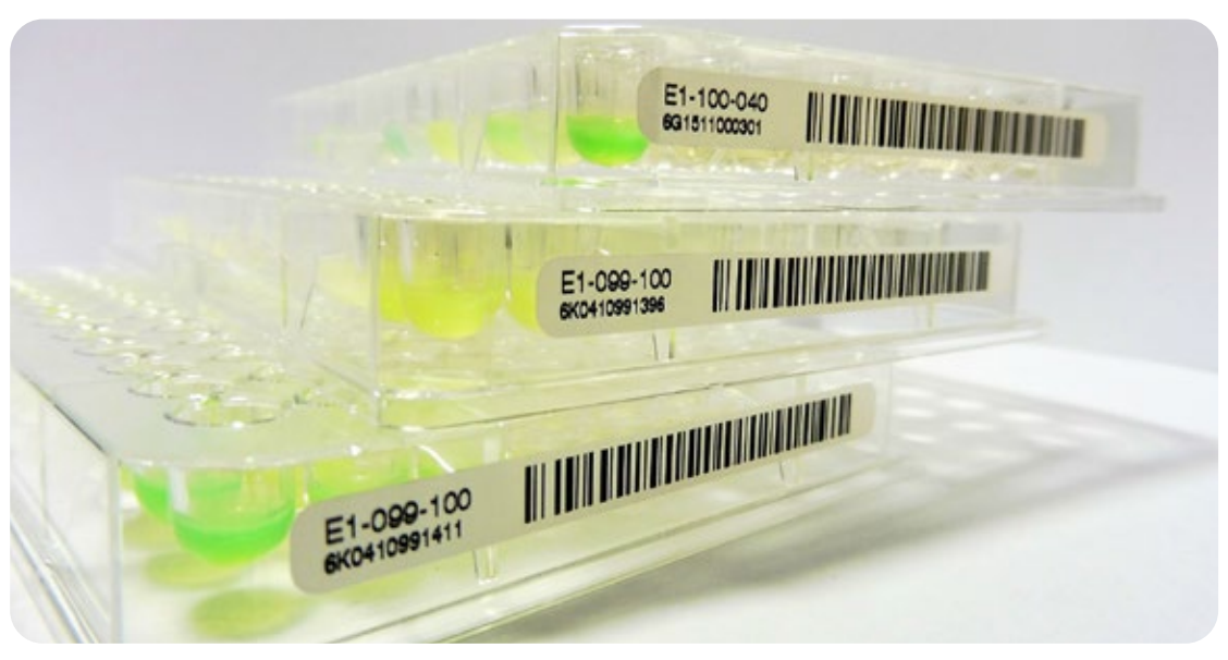
Fig 2: The MICRONAUT system offers customized plates for Antimicrobial Susceptibility Testing (AST) of Multi-Drug Resistant microorganisms.

In this era of emerging multi-drug resistant bacteria, which have become an important clinical threat, antimicrobial susceptibility testing based on true MIC values is important to provide clinicians with detailed information for an optimal therapeutic approach and a better clinical outcome."