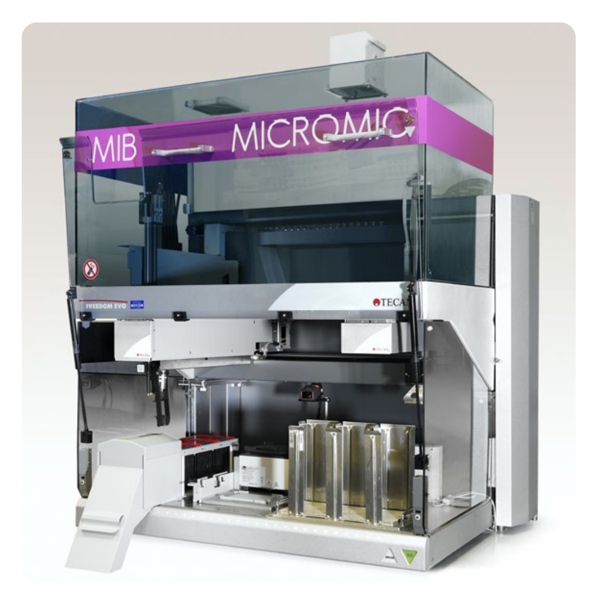
Fig. 4: The Micromic (TECAN FREEDOM EVO 100 platform) device combines barcode reading of the bacterial suspension, McFarland adjustment, inoculum preparation as well as inoculation and reading of MICRONAUT AST plates.

The enhanced workflow, by combining robotic technology and the MICRONAUT system, has been a key aspect in the success for Dr. Scarparo and his team. The automation results in increased standardization and accuracy, decreased risk of human error and complete traceability of the entire process.