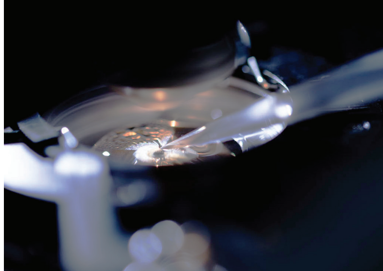
The inside of Bruker's NanoTracker 2 head, and a pipette adding one drop of buffer.

Atomic force microscopy and steered molecular dynamics simulation let the group explore SARS-CoV-2 receptor binding domain variants and the angiotensin-converting enzyme 2 (ACE2). His research using the single-molecule force spectroscopy technique suggested that vaccination before infection may provide stronger protection across variants. 3 Understanding the binding interface between the virus and human cell receptors has been the main focus of his research over the last year.