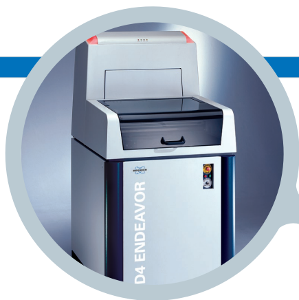
D4 ENDEAVOR X-ray diffractometer