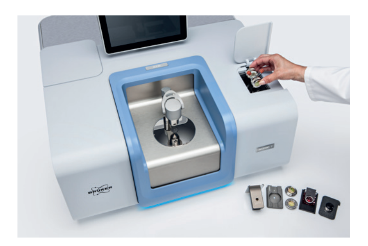
Fig. 4 INVENIO FT-IR plattform offers higher sensitivity and many productivity tools to enhance routine analysis tasks. A special feature is the transit channel, a second sample compartement.

Diesel engine lubricants have dispersants designed to suspend and control the size and growth of soot particles. If the levels of soot exceed the oils' capacity to hold them, the viscosity of the oil increases and carbon sludge can accumulate which starts clogging filters and passageways.