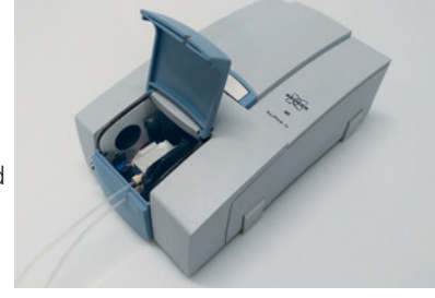
Fig. 1 ALPHA II FT-IR spectrometer equipped for oil analysis.

Therefore, the ASTM adopted a standard practice E2412 titled; "Standard Practice for Condition Monitoring of Used Lubricants by Trend Analysis Using Fourier-Transform Infrared (FT-IR) Spectrometry" illustrating the increased application of FT-IR spectroscopy in this field.