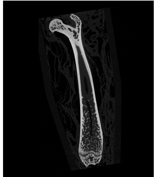
Figure 2: Reconstructed image of a 6 minute scan of a whole mouse femur.