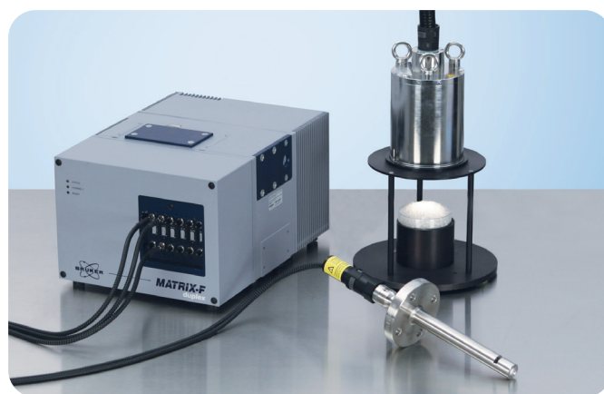
FT-NIR Process Spectrometer MATRIX-F with Probe an sensor head

Modern control software hands the data over to the process control system and if the product is running out of specification, it will be detected within seconds and corrective measures can be carried out. With the classical off-line analysis, several hours can pass before the sample