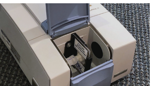
Fig. 1 left: OSS ClearShot™ oil and grease extractor. right: Oil membrane mounted inside ALPHA II FT-IR spectrometer