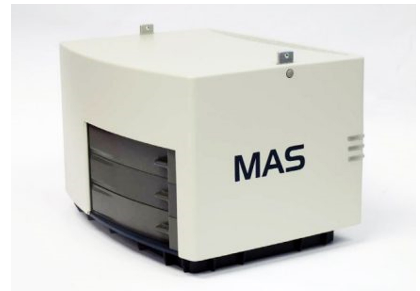
Fig. 3 MAS 3 Magic Angle Spinning Unit

Depending on which type of probe is connected to the spectrometer, the correct drive and bearing pressure profiles are automatically selected to ensure smooth spin-up and stable rotation. The MAS 3 unit is used for CPMAS, HRMAS, and MAS CryoProbes.