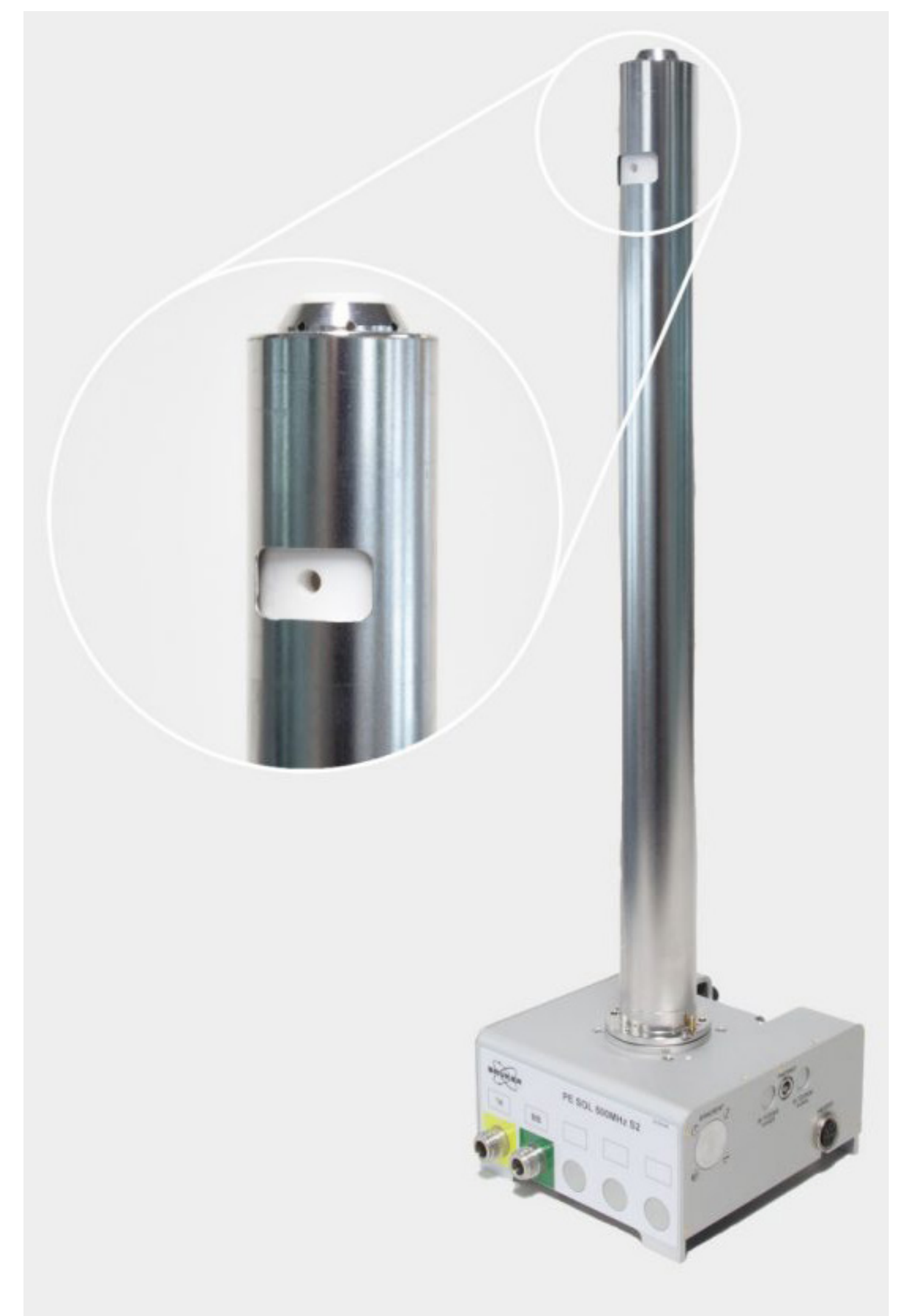
Fig 5: Bruker SB Static Probes