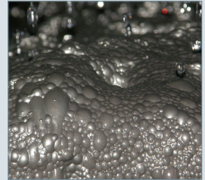
3) Flotation – locking/ liberation and association