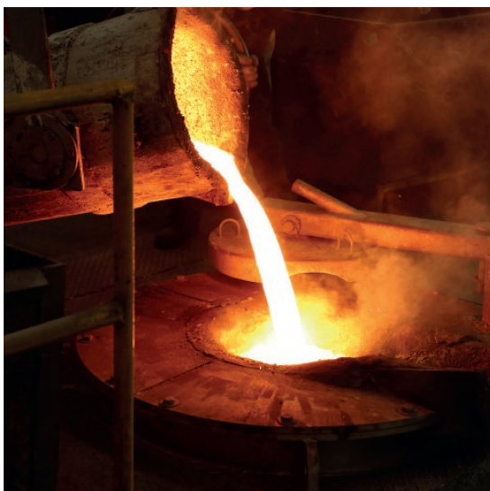
Figure 1: Molten iron poured from ladle into melting furnace.

The S2 PUMA is ready for challenging industrial environments. High system uptime is ensured by SampleCare™ technology, high-duty air filters, sturdy design, and overall high quality components. The integrated vacuum mode minimizes the operational costs when compared to XRF systems with helium mode only. The ergonomic TouchControl™ interface and the intuitive SPECTRA.ELEMENTS software make process control a simple task.