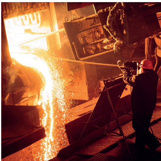
Figure 1: Sampling from an electric arc furnace.

The S2 PUMA is ready for challenging industrial environments. High system uptime is ensured by SampleCare™ technology, high-duty air filters, sturdy design, and overall high quality components. The integrated vacuum mode minimizes the operational costs when compared to XRF systems with helium mode only. The ergonomic TouchControl™ interface and the intuitive SPECTRA.ELEMENTS software make process control a simple task.