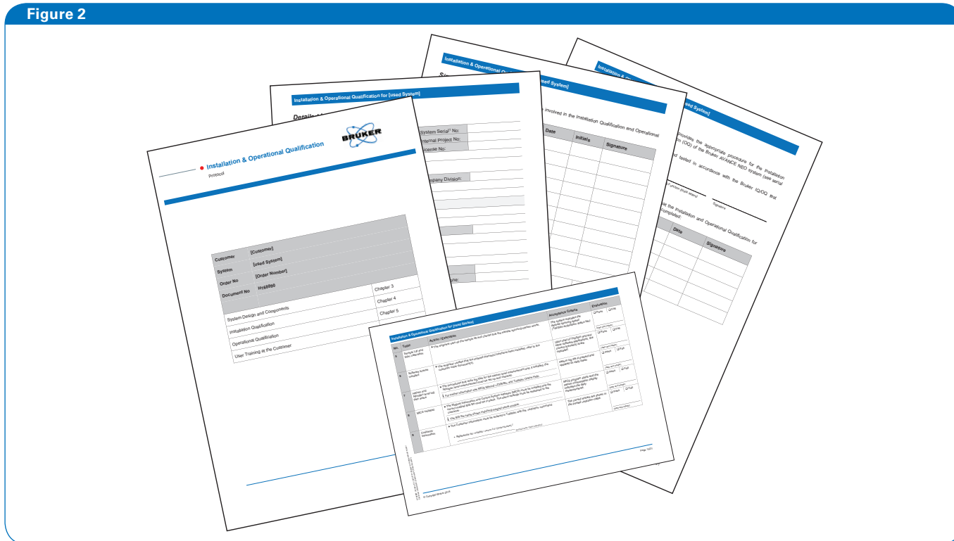
Example pages from the IQ / OQ protocols