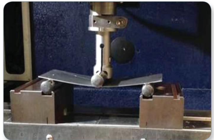
3-point-bend test setup on UMT.

Bruker's UMT can be equipped with an easy-to-use 3-point-bend module for assessing various properties of laminate and sheet materials. Tests can be run under load-control or displacement-control modes.