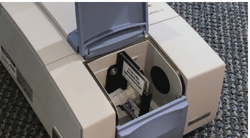
Fig. 1 left: OSS ClearShot<sup>™</sup> oil and grease extractor. right: Oil membrane mounted inside ALPHA II FT-IR spectrometer