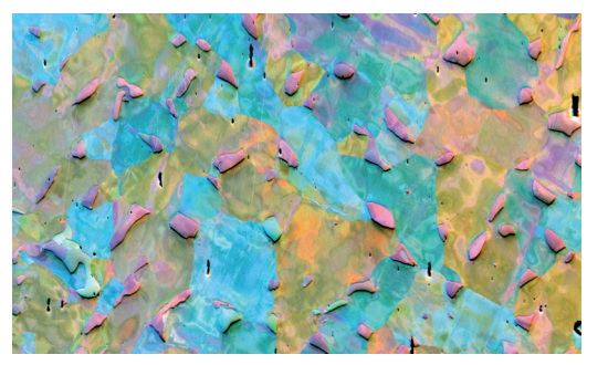
Color coded image produced by mixing the signals of the Bruker FSE detectors, showing microstructural details invisible in the grayscale image.

Each one of the three FSE detectors positioned below the phosphor screen captures a different part of the diffraction