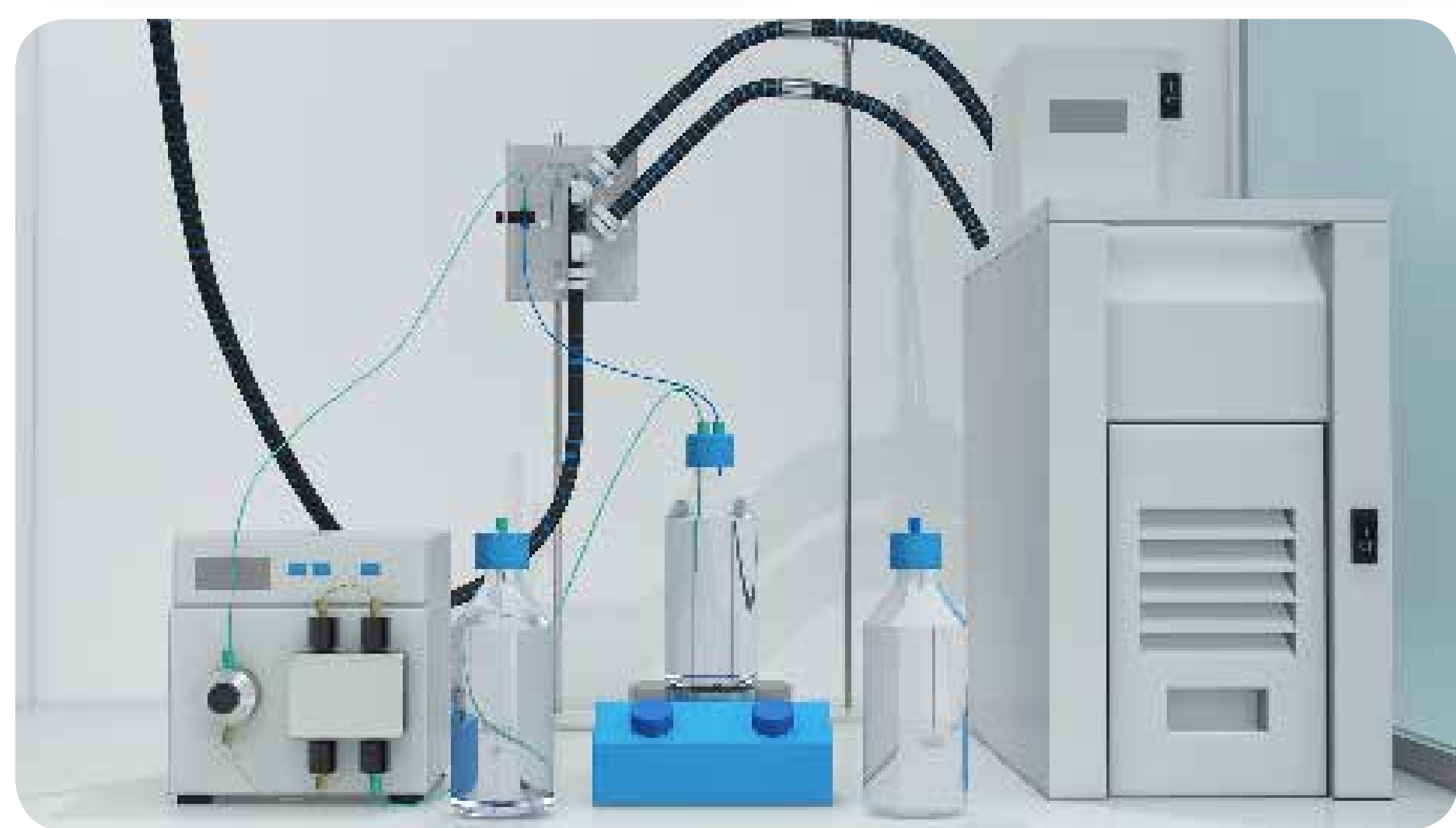
Fig. 1: InsightMR flow tube assembly (left) and yeast cells (right), and typical laboratory setup (bottom)>

Dynamic monitoring of bioprocesses is useful for understanding reactions and optimizing processes. Fermentation processes can be monitored easily using NMR, by measuring the increasing concentration of ethanol in the mixture.