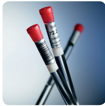
Bruker SFC Calibration Standards for a pre-calibrated minispec SFC analyzer. The samples are delivered together with a certificate, which is valid for 2 years.