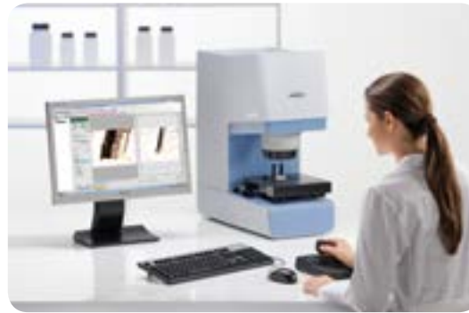
Analysis of a polymer laminate with the FTIR microscope LUMOS.