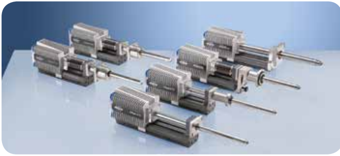
The XFlash® 6 detector series for SEM and TEM