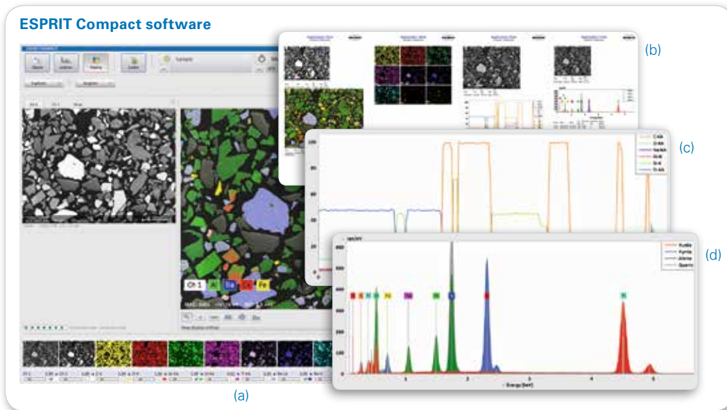
ESPRIT Compact with mapping (a), report (b), line scan (c), and spectrum (d)