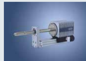
XFlash® 600Mini detector

Sum spectrum (gray) of maps above and deconvoluted element peaks for silicon (blue) and tungsten (yellow)