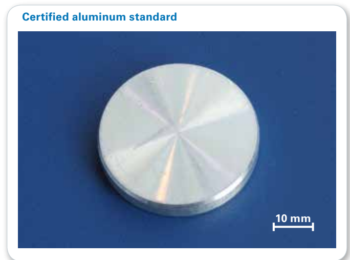
Fig. 1 Photograph of the analyzed specimen Alcoa Deltalloy® 4032

The example demonstrated here shows the improvement of trace element detection in a certified aluminum alloy (Alcoa Deltalloy® 4032, Fig. 1) with Micro-XRF on SEM.