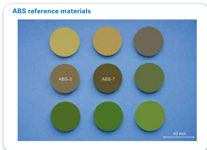
Fig. 1 All samples of the reference material (acrylonitrile butadiene styrene, ABS) indicating the analyzed specimens ABS-3 and ABS-7.

The measured polymeric material is an acrylonitrile butadiene styrene (ABS) with low metal content. The specimens were investigated to check the XRF detection limit. The BAM (Federal Institute for Materials Research and Testing in Germany) has developed a set of reference materials (Fig. 1). Two of these ABS materials (ABS-3 and ABS-7) were selected for the measurements described in this application note.