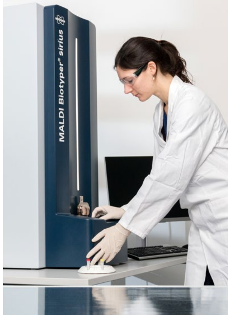
MALDI Biotyper sirius System