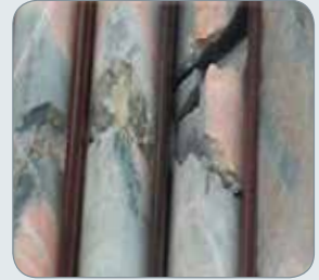
1) Drill cores – modal mineralogy, association