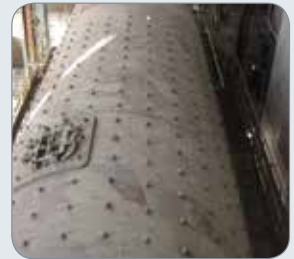
2) Milling – grain sizing, liberation