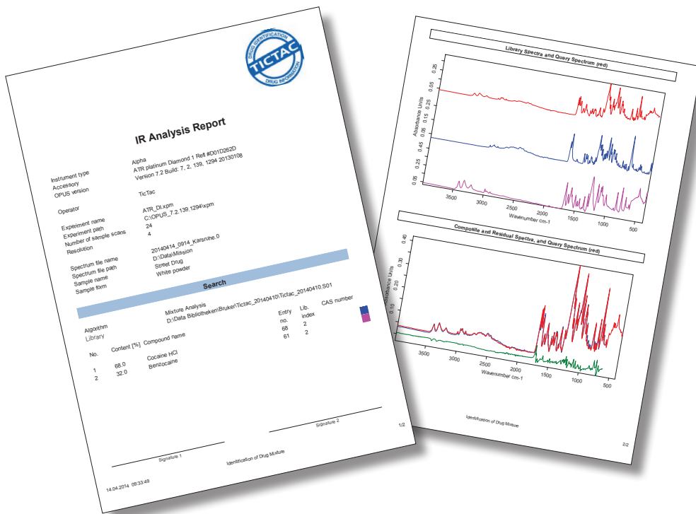
Fig. 3 Analysis report of the identification of street drug components using the mixture analysis function of the OPUS software together with the TICTAC FT-IR drug library.