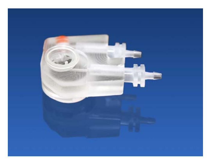
Fig. 1 JPK 3-port small volume SmallCell<sup>™</sup>, tubes would attach to the main inlet and outlet ports shown on the right.

Where a valuable protein solution is needed the user can inject this directly into the cell through the septum in the third port as depicted in Fig 3.