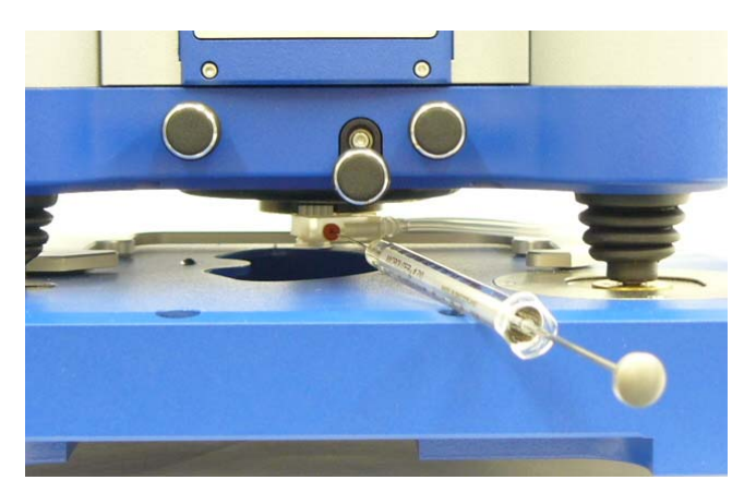
Fig. 3 Valuable solutions can be injected directly into the cell through the septum in the third port.

At the end of the experiment the components can be cleaned by, for example, sonication or be replaced. The polycarbonate fluid cell itself can be autoclaved.