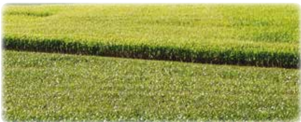
Molecular view of corn leaves