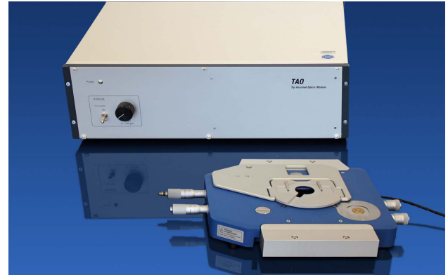
TAO™ module including controller

Spatial resolution at the sub-nanometer level, excellent linearity and precise positioning – the power of the scanners in the integrated TAO system comes from piezo elements of PI (Physik Instrumente) that have been custom developed for JPK. The parallel kinematics scanners with friction-free flexure systems guarantee the best results in dynamics, resolution, and reproducibility. All axes are equipped with integrated capacitive sensors – a guarantee for sub-nm positioning accuracy and long-lasting stability during measurements. A positioning stability in the nanometer range and manipulation capabilities at the true nanoscale are the results of this approach. The complete software integration with a multitude of operation modes enables the full capability of the hardware while leaving sufficient room for the user's creativity and self-designed experiments through software scripting.