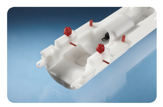
Arterial Spin Labeling coil

The MRI CryoProbe is the pinnacle of Bruker's preclinical coil portfolio, which is larger than any other company on the market. To address our customers' needs, Bruker also offers specialized coils, such as ASL- and optogenetic coils. Of course, the full range of classic room-temperature <sup>1</sup>H- and X-nuclei are available as well as Parallel Transmit coils with up to 8 channels and receive phased array coils with up to 16 channels. These multi-transmit and multi-receive coils are optimally supported by the inherently multi-transmit-receive AVANCE NEO electronics.