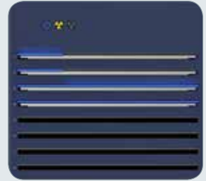
Measurement status LED