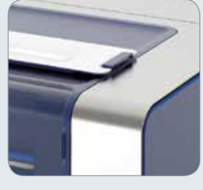
S4 T-STAR® with storage box