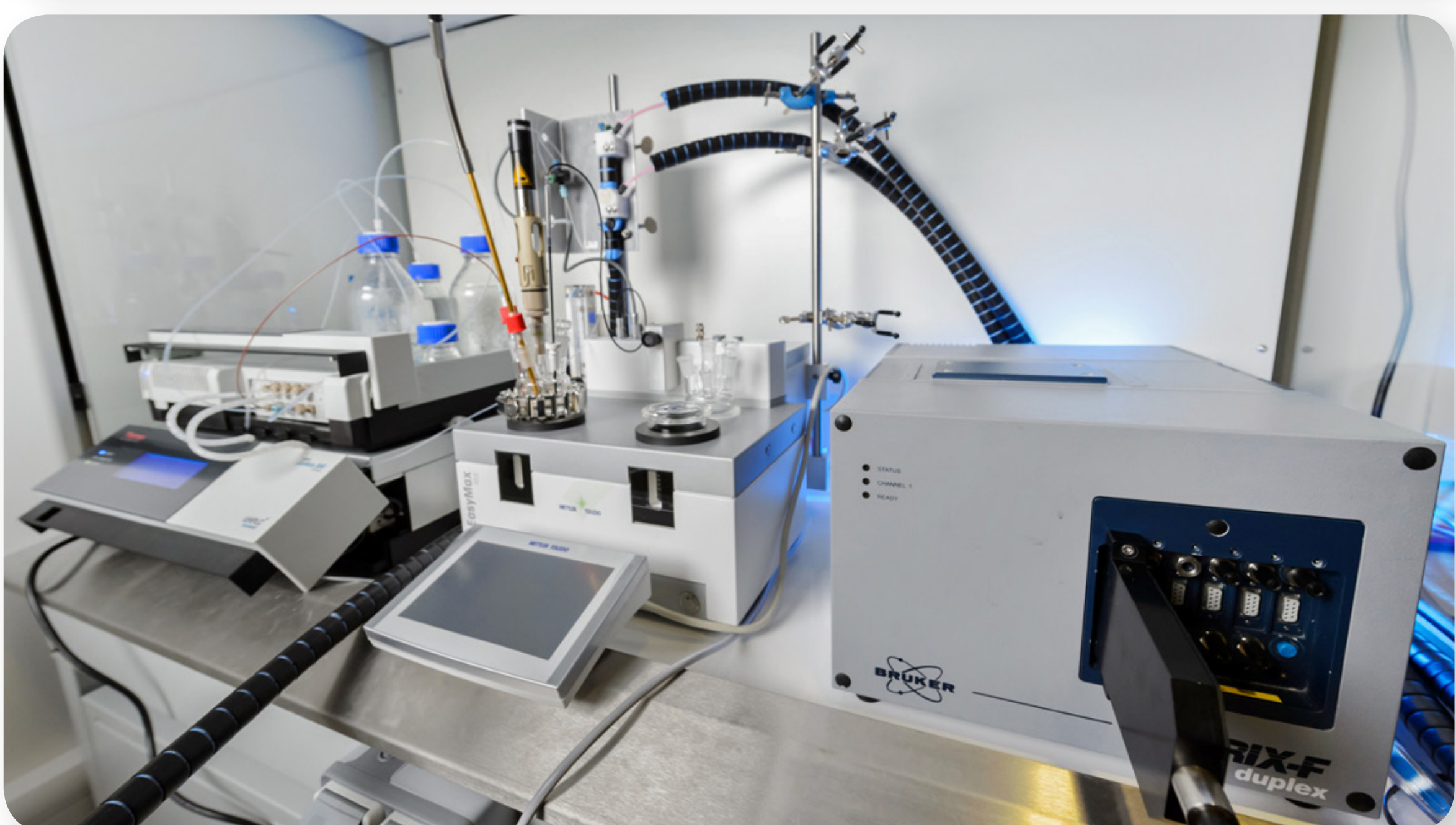
Fig. 2 Laboratory setup. Top: InsightMR flow unit, spectrometer, pump, vessel and bath. Bottom: Simultaneous online NMR and in-situ IR monitoring.