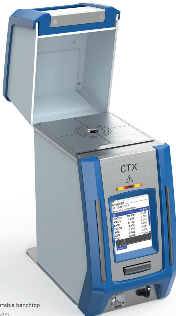
Figure 1 CTX – Portable benchtop XRF analyzer

No matter what requirements you have and what samples you want to examine, applications for the CTX are almost limitless as this portable XRF analyzer can measure solids, liquids, and powders wherever they are found or used. Typical applications are not only alloy identification and quality control, scrap metal recycling, analysis of precious metals and wear metals in oil, but also mining, environmental, agriculture, food and consumer safety applications. Fast analysis speed and exceptional accuracy when measuring the elemental composition of a sample make the CTX the ideal choice for analyzing and sorting multiple sample types including incoming material, finished goods and production parts with non-destructive XRF spectrometry.