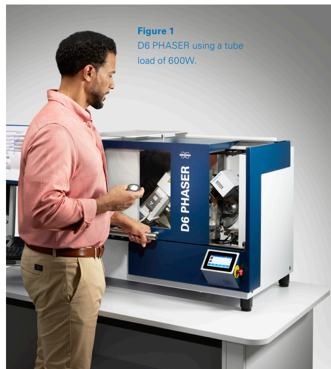
Figure 1 D6 PHASER using a tube load of 600W.

The combination of the energy dispersive LYNXEYE XE-T detector and the motorized air scatter screen (MASS) results in data with outstanding low and flat background. Thanks to the superb energy resolution of the detector not only K-beta is removed, without the need for a filter, but also iron fluorescence and white beam residues are eliminated. The motorized air scatter screen removes air scattering in the low angle range, which results in a linear background. Consequently, this methodology leads to a notable improvement in the detection limits for minor and amorphous phases. Additionally, it enables the accurate quantification of phases associated with pre-hydration, such as Syngenite and Ettringite, which exhibit their primary peaks within the lower angle range.