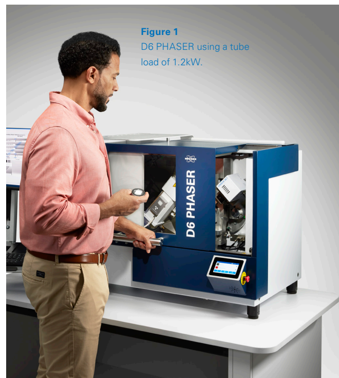
Figure 1 D6 PHASER using a tube load of 1.2kW.

The combination of the energy dispersive LYNXEYE XE-T detector and the motorized air scatter screen (MASS) results in data with outstanding low and flat background. Thanks to the superb energy resolution of the detector not only K-beta is removed, without the need for a filter, but also iron fluorescence and white beam residues are eliminated. The motorized air scatter screen removes air scattering in the low angle range, which results in a linear background. Consequently, this methodology leads to a notable improvement in the detection limits for minor and amorphous phases. Additionally, it enables the accurate quantification of phases associated with pre-hydration, such as Syn-genite and Ettringite, which exhibit their primary peaks within the lower angle range.