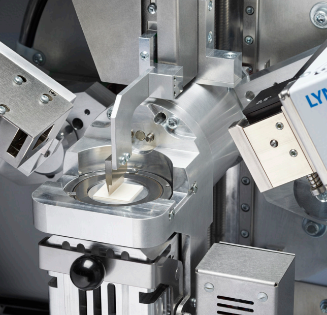
Figure 2 Rotation Sample Stage with motorized Primary Optics and motorized Air Scatter Screen.