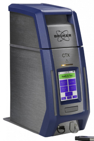
CTX™ Portable XRF analyzer Mg (12) to U (92)

Bruker's portable Counter Top XRF, the CTX™, is for qualitative and semi-quantitative elemental analysis. It also performs quantitative analysis when utilizing calibrations with like-sample standard reference materials. Results can be given as spectra, composition, or Pass/Fail/Inconclusive for single or multi-elemental analysis of elements from Mg to U. The convenient form factor of the CTX is ideal for samples presented in containers such as powders, soils and liquids; small samples; and those which require extended measurements of more than a few seconds.