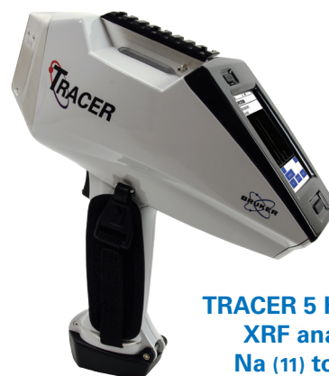
TRACER 5 Handheld XRF analyzer Na (11) to U (92)