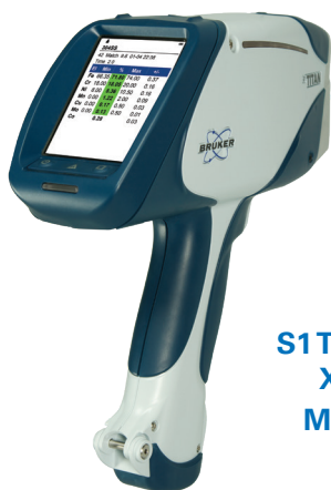
S1 TITAN Handheld XRF analyzer Mg (12) to U (92)

Bruker's two handheld XRF spectrometers, the TRACER 5™ and the S1 TITAN™, are for qualitative and semi-quantitative elemental analysis. They also perform quantitative analysis when utilizing calibrations with like-sample standard reference materials. Results can be given as spectra, composition, or Pass/Fail/Inconclusive for single or multi-elemental analysis of elements from Na to U. A desk or bench top stand with a PC can be used for samples presented in containers such as powders, soils and liquids; small samples; and those which require extended measurements of more than a few seconds.