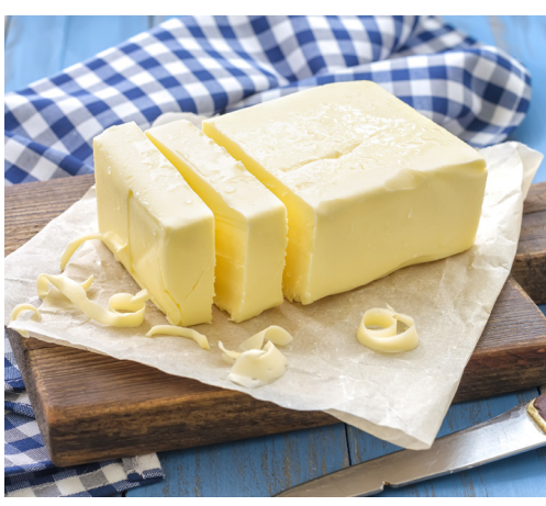
Figure 3 Perfect butter with perfect droplet size distribtion