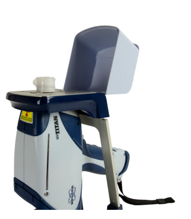
S1TITAN Handheld XRF analyzer Mg (12) to U (92)