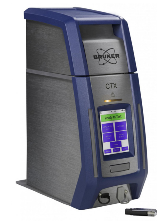
CTX<sup>™</sup> Portable XRF analyzer Mg (12) to U (92)