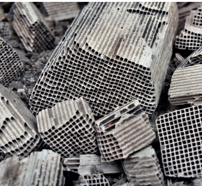
Figure 1 Typical monoliths from catalytic converters coated with PGE-containing films.

The instrument is perfectly equipped for industrial environments due to its ergonomic TouchControl™ interface for routine operation without any PC peripherals. The powerful user account control of the spectrometer's software SPECTRA.ELEMENTS and the sturdy design of the S2 PUMA guarantee a high instrument uptime.