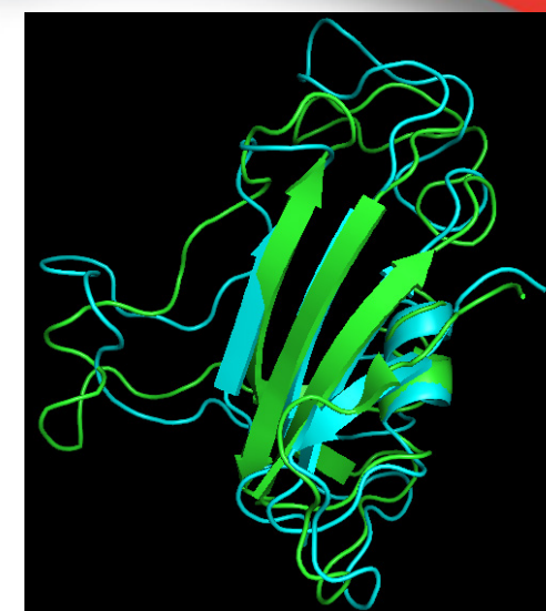
Molecular dynamics simulation structures of wt (ordered) (green) and F37A/I115P dm (disordered) (cyan) proteins.