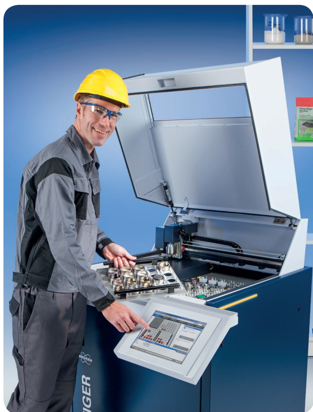
Figure 1: Quick and easy start of samples with TouchControl and EasyLoad of the S8 TIGER Series 2

Wavelength dispersive X-ray fluorescence analysis (WDXRF) enables manufacturers the quick and precise control of all major impurities in the anode coke. With the S8 TIGER with 1 kW this task is easily accomplished with little installation. Based on 1 kW X-ray power the S8 TIGER Series 2 doesn't require any external cooling water or compressed air, but delivers the analytical performance one would need to control impurities in coke and coal. This lab report will show the analytical performance of the S8 TIGER Series 2 and outline the specific benefits for this task.