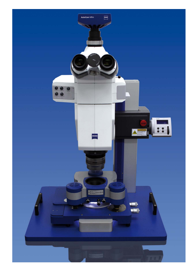
Fig. 1: The JPK NanoWizard® 3 in combination with an Axio Zoom.V16 from Zeiss

The upright fluorescence microscope kit for NanoWizard<sup>®</sup> 3 AFM and CellHesion<sup>®</sup> 200 is based on a solid and stable stand which holds an Axio Zoom.V16 from Zeiss. The stand can be equipped with a life science sample stage,