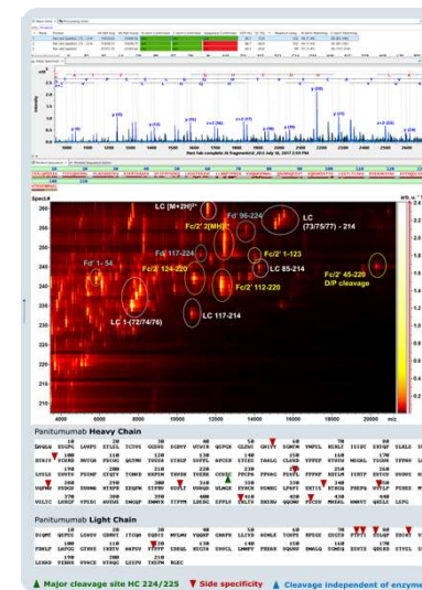
Fig. 2 MALDI-ISD analysis of panitumumab clipping variants

Also MDS (see Fig.2 ) or tryptic digest analyses are very suitable to validate clipping sites.