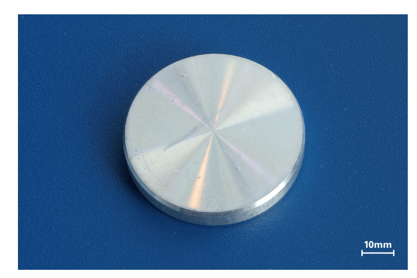
Figure 1 Photograph of the analyzed specimen Alcoa Deltalloy® 4032

The example demonstrated here shows the improvement of trace element detection in a certified aluminum alloy (Alcoa Deltalloy® 4032, Figure 1) with micro-XRF on SEM.