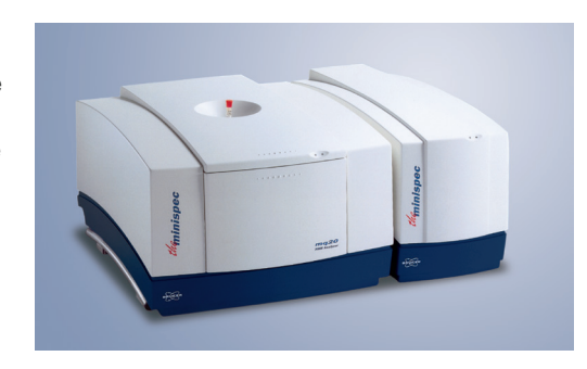
Figure 1: Bruker is the only vendor offering 40 and 60 MHz systems for contrast agent research.

The Contrast Agent Analyzer can be ordered with the 21 CFR part 11 compliant minispec Plus software, that offers user management, experiment set-up, measurement control, and automated report generation.