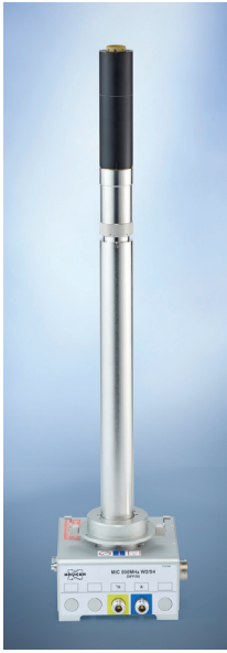
Figure 1 Image of MICRO5 probe base and gradient set with wide bore adaptor.