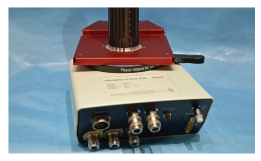
Please remove for non-Prior