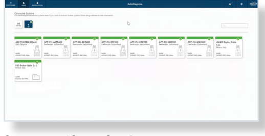
Spectrometers' System Overview